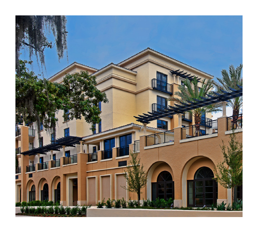
2023 Workshop on Teaching

January 28-31, 2023 The Alfond Inn Winter Park, Florida