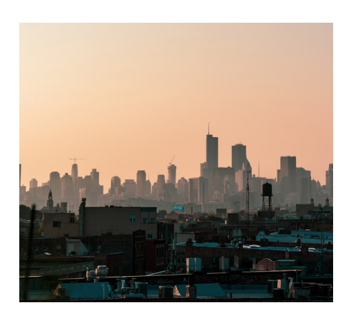
2023 Fall Meeting

April 14-16, 2023 Grand Hyatt Seattle Seattle, Washington